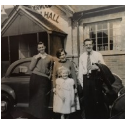
Church in 1950s

Other community groups use our church building from the benefit of local people. This includes various groups including those for health and well being. We run courses helping people who are isolated, by teaching cookery and personal development. Additionally, we distribute approximately 30 emergency food parcels each week to those in need in conjunction with another local charity.