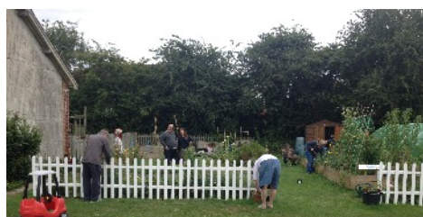
Community Garden Project